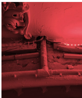
Gas nozzle extending from the ring of gas jets to the attic side of the dome.